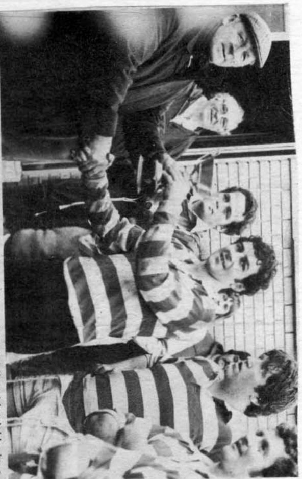
Association after beating Llandybie in a thrilling final.