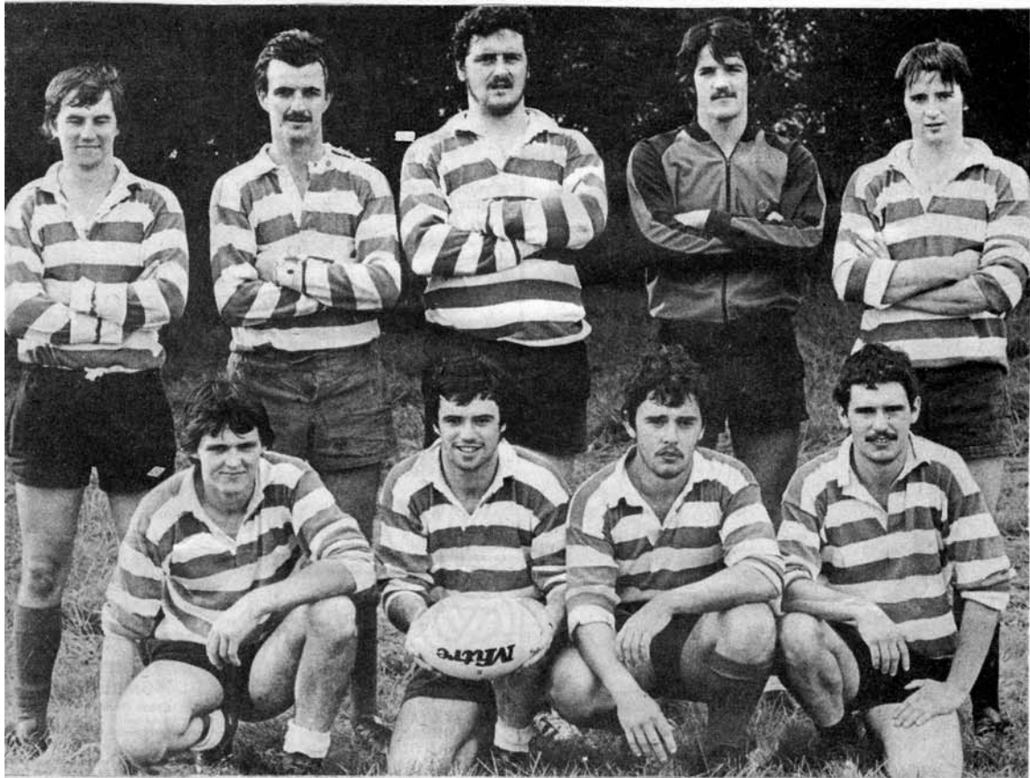
Llandovery RFC's Seven-a-Side team helped to celebrate the club's centenary year by winning their own sevens tournament.