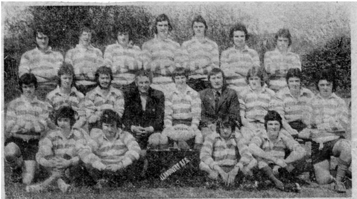
The club's Youth team, however, went a step further. They reached the final of the Amman Valley Youth Cup. SEASON 1975-76.