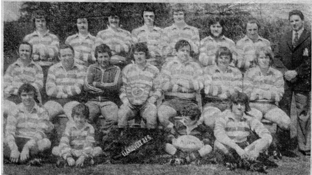
Llandovery's Second XV got among the trophies, winning a shield for finishing top of their section in the Llanelli District Championship.