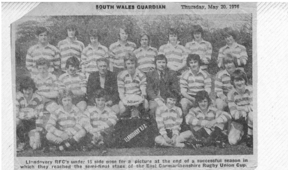
Llandovery RFC's under 15 side pose for a picture at the end of a successful season in which they reached the semi-final stage of the East Carmarthenshire Rugby Union Cup.