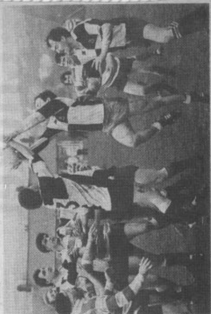
"It's mine", "No it's mine". Two Tumble forwards reach for the same ball.