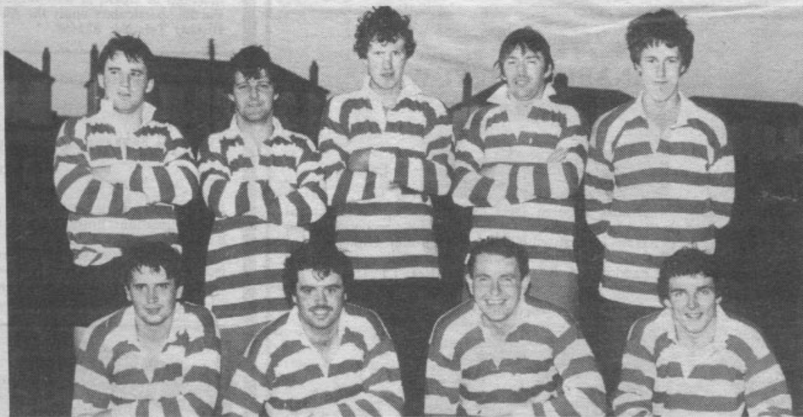
Smiling winners Llandoverey after winning the C. C. Evans sevens at Cwmaman Park last week. They went on to win the District F sevens two days later.