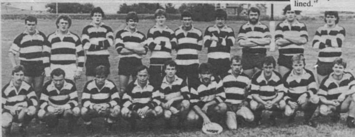
• The Llandeilo team that took on a Carmarthenshire Select XV in last week's celebration game.