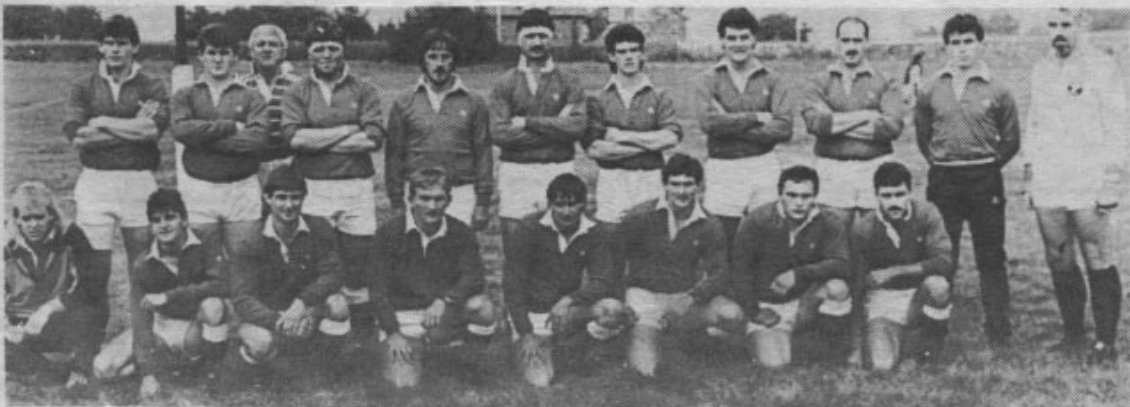
• The Carmarthenshire Select XV.