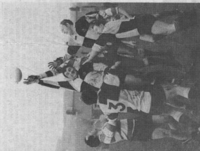
Llandovery and Tumble forwards contest a line-out.

Section A four times in the last five years, their only hiccup being last year when they were second to Vardre.