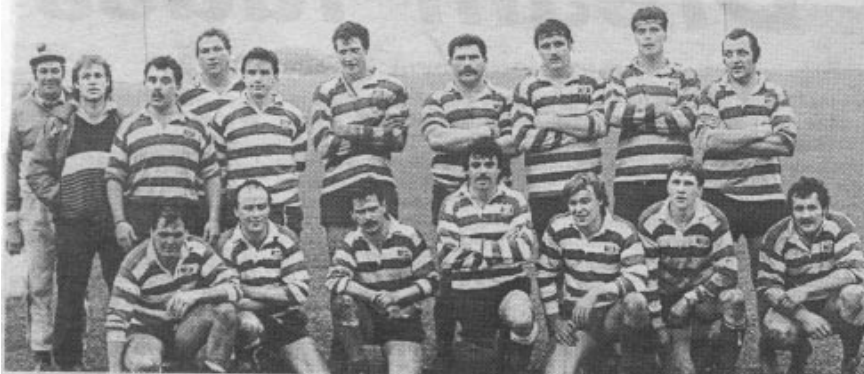
• LLANDOVER, pictured after the 15-0 victory over Bynea on Monday night which carried them through to the West Wales Championship Final at Stradey Park.