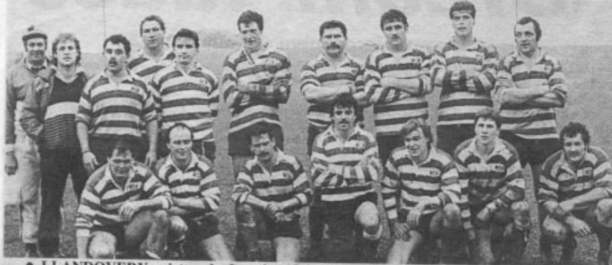
• LLANDOVERY, pictured after the 15-0 victory over Bynea on Monday night which carried them through to the West Wales Championship Final at Stradey Park.